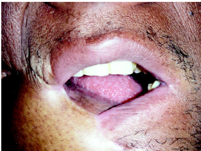
Fig. 2: Postoperative results with partial bipaddle PMMC flap

concepts. 1,2 Even though primary closure of the lip commissure is often advocated for competence of oral cavity after surgery, it can lead to microstomia that can get progressive over time (more so with co-existent submucous fibrosis). Partial bipaddling of PMMC for commissural reconstruction reduces the problem of incompetence without compromising on the adequacy of mouth opening (Fig. 2). So we propose further modification of bipaddle PMMC flap to reconstruct lip commissure along with full thickness cheek and mucosa defect.