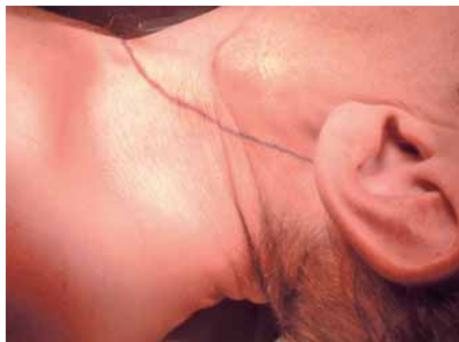
Fig. 1: Marking the incision

We have found that the perfusion of this flap was adequate capitalizing on the cutaneous branches of the facial