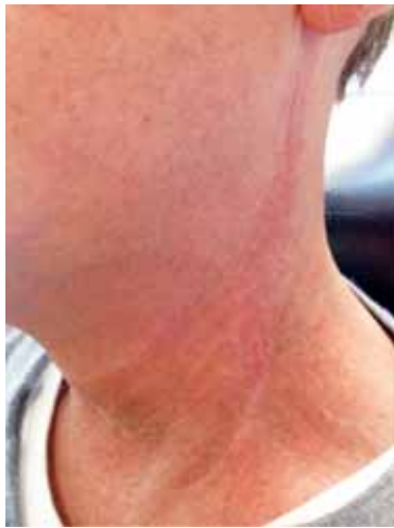
Fig. 4: Six months postoperative appearance in a patient with a previously irradiated neck

artery to supply the flap in a superoinferior direction. This is demonstrated by a lack of wound breakdown in our patient group. This consistent arterial supply is of particular importance in the previously irradiated neck.