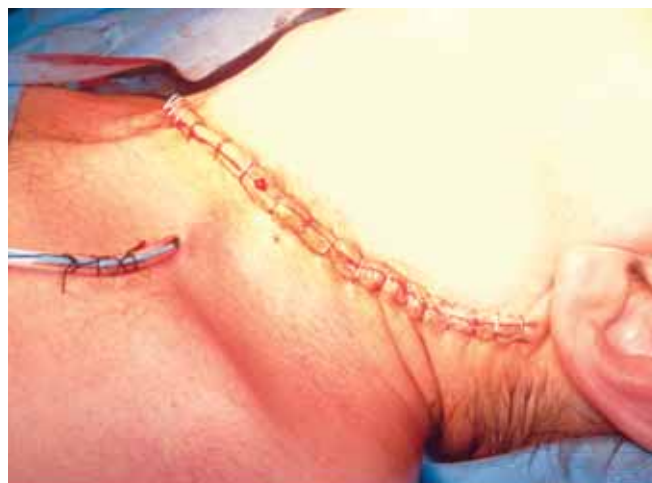
Fig. 3: Closure of neck