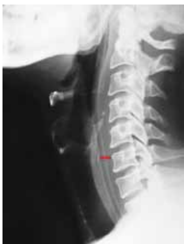
Fig. 5: Postoperative X-ray soft-tissue neck lateral view showing the same linear radiopaque shadow confirming the vertical ossification of cricoid lamina

cartilage ossification is very essential in the prompt diagnosis and management of impacted foreign bodies in upper digestive tract.