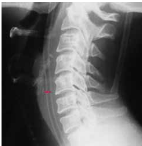
Fig. 3: Check X-ray soft-tissue neck lateral view showing a linear radiopaque shadow at the C5-C6 level just posterior to cricoid cartilage and anterior to the shadow of Ryle's tube

Plain films (lateral view of the neck) play an important role in diagnosis of these foreign bodies as vast majority (88%) of the foreign bodies are found to be radiopaque. 1 At times ossification of airway cartilages on plain X-ray film can be interpreted or confused as foreign bodies. The awareness of the radiographic feature of normal laryngeal