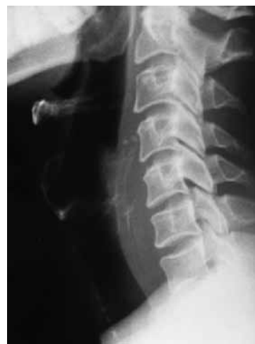
Fig. 1: X-ray soft-tissue neck lateral view showing irregular radiopaque foreign body at the level of C5-C6

In view of the positive clinical history, persistent symptoms and clinical examination findings, an X-ray of the soft tissue neck lateral view was taken. It showed an irregular shaped radiopaque foreign body at the level of C5-C6 with no significant prevertebral widening or air shadow or air fluid level (Fig. 1). An emergency hyopharyngoscopy was done under local anesthesia. The foreign body was found at the cricopharyngeal level and the surrounding mucosa was found inflamed. It was removed endoscopically and was a 1.5 cm sized, irregular shaped fish bone broken into