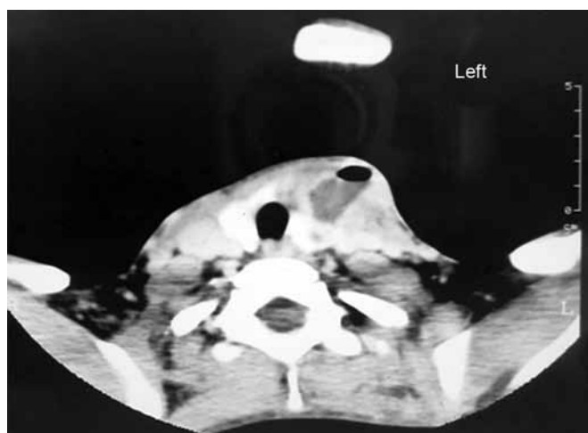
Fig. 1: Computed tomography scan of the neck