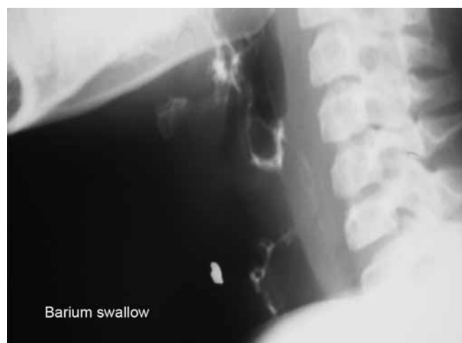
Fig. 2: Barium esophagogram