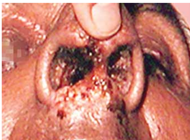
Fig. 3: Nasal tip and supratip area studded with multiple papules and destruction of columella

Primary mucocutaneous tuberculosis of the nasal region is one of the rarest forms of extrapulmonary tuberculosis but, still poses a significant clinical and diagnostic challenge. Nasal tuberculosis was first reported in 1761 by Giovanni Morgani, who described autopsy findings of a young man with ulcerative lesions in the soft palate, nasopharynx, and nasal cavity. 2 It usually occurs secondary to pulmonary Koch's via contagious, hematogenous or lymphatic routes. Otherwise, organisms may be introduced into the nose by inhalation of infected droplets or dust. Primary cases are very rare despite the increase in extrapulmonary tuberculosis. 3 In a review of 20th century