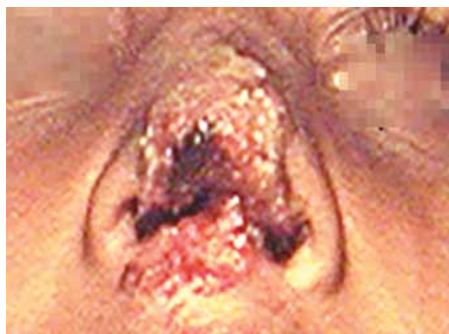
Fig. 4: Ulcer over nose with destruction of columella and reddish-brown papules over tip of nose and both ala nasi