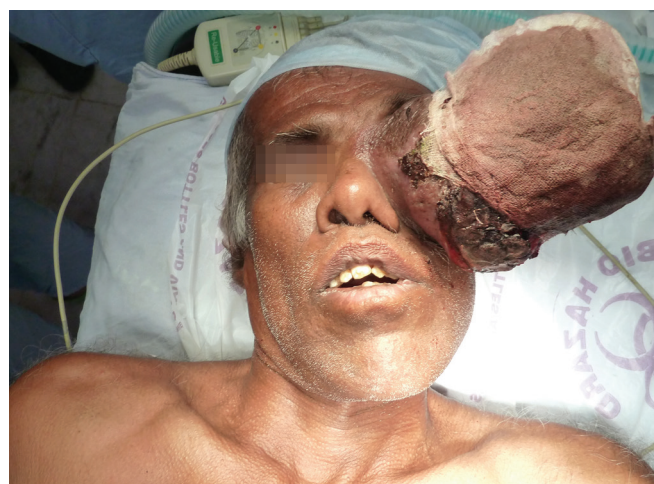
Fig. 1: Preoperative picture showing the tumor

As the patient had active bleeding on presentation and earlier biopsy had shown hemangioma, clinical diagnosis of hemangiopericytoma was done. The patient underwent