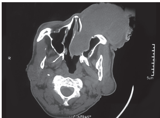
Fig. 2: CT PNS showing heterogeneously enhancing mass lesion arising from left preseptal region from lower eyelid, causing erosion of medial wall and floor of left orbit