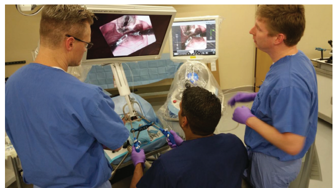
Fig. 3: The senior author testing the Flex robotic system