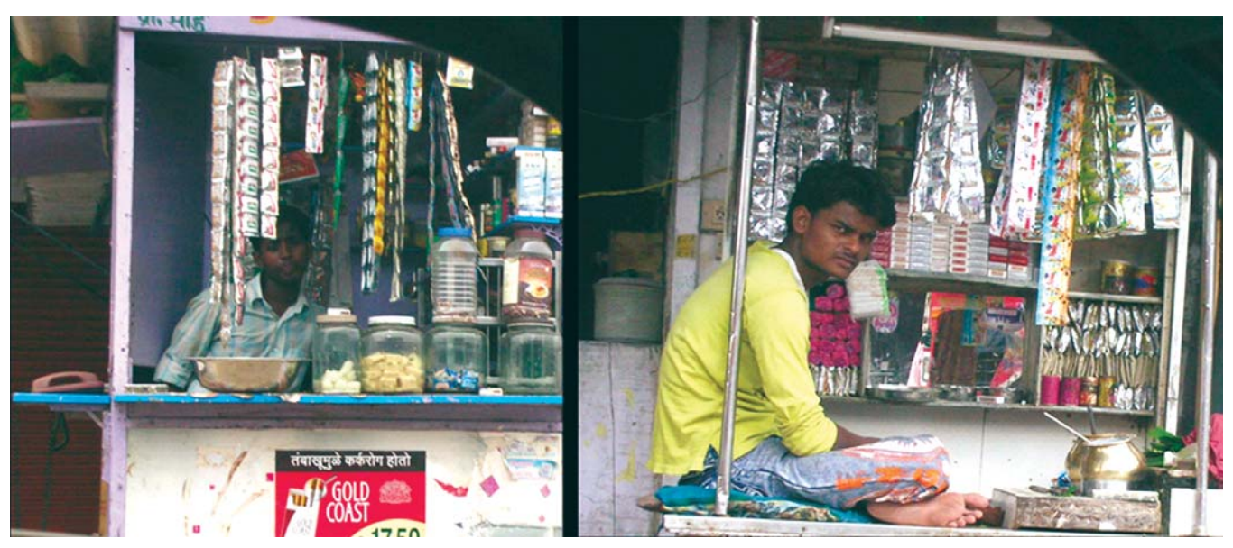
Fig. 2: Pictures showing young boys selling tobacco and areca nut products in Mumbai. Areca nut products are freely available to younger generation who consider it as a mouth freshener

millions of Indian. To begin with, a strong pictorial health warning or at least a textual statutory warning should be made mandatory on all such products. Even in absence of such a law, it is the responsibility of the manufacturers to inform their patrons about the hazardous nature of their products. In addition, there should be a ban on advertising (direct and indirect) of this product, ban on sale to minors, impose restriction on chewing in public place/work place and spitting should invite big penalty. The California Environment Protection Agency has listed Areca nut as carcinogen and a hazardous product. <sup>22</sup> Taiwan, the land of