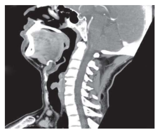
Fig. 3: Sagittal computed tomography (CT) image showing mass arising from posterior wall of subglottis

Fig. 2: Axial computed tomography (CT) image showing presence of mass in posterior wall of subglottis with no cartilage erosion