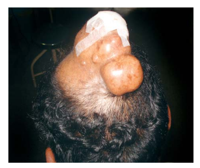
Fig. 1: Tumor at time of presentation

A 61 years old gentleman presented with a large nodular swelling of his scalp gradually increasing since 12 years. A recent increase in size with the onset of pain prompted him to seek medical attention at an outside clinic where in an