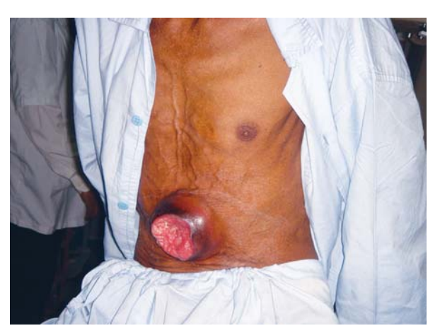
Fig. 1: Clinical photograph of patient with PEG exit site metastasis

Subsequently, on follow-up 8 months after surgery (15 months after placement of PEG tube) patient presented with complaints of painful ulcer and swelling on anterior abdominal wall, at the PEG site since 2 months. On clinical examination, patient was locoregionally controlled but had an ulcerative growth at the gastrostomy site that was friable and bleeding (Fig. 1). On further investigations, upper gastrointestinal endoscopy revealed a large deep