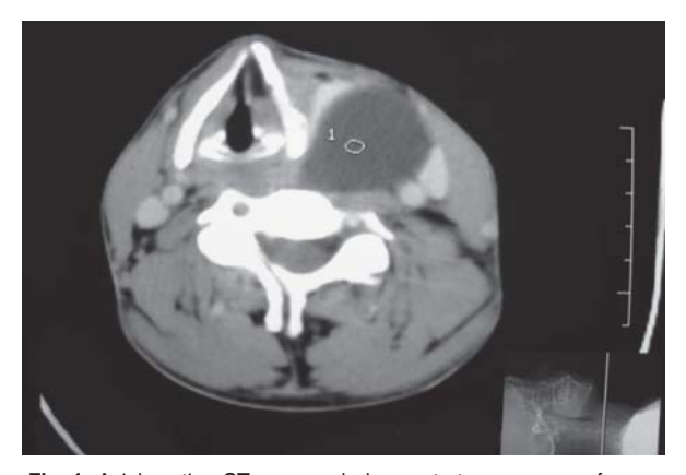
Fig. 1: Axial section CT scan neck demonstrates presence of mass pushing larynx to the opposite side

A previously fit and well, 35-year-old man presented to us with a 6 month history of a left-sided neck swelling and change in voice. He had no dysphagia or respiratory compromise. Past medical history was unremarkable and he was on no regular medications. He was a nonsmoker. On examination, a large (7×5 cm) left supraclavicular swelling was noted. The mass was firm in consistency. A separate mass was felt to the left of the sternocleidomastoid. There was no evidence of a fistula. No other masses or lymph nodes were palpated in the axillae or groin. Respiratory and abdominal examinations were normal with no evidence of organomegaly. The full blood count results were within the normal limits. The chest X-ray revealed a smooth rounded mass lying in the left paratracheal region. A hematological investigation was made, and a computerized tomography (CT) scan obtained. CT revealed a mass arising from the