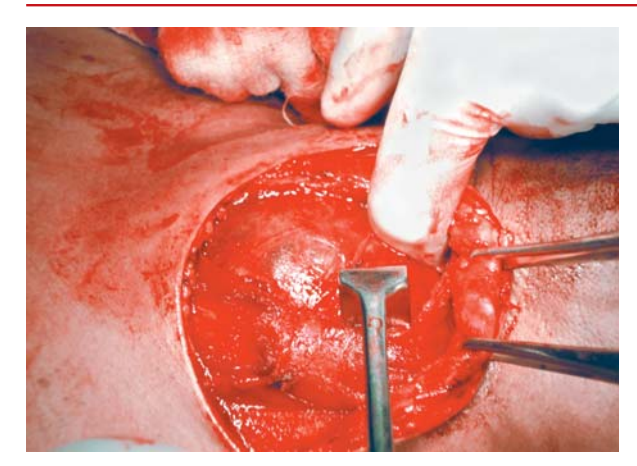
Fig. 3: Operative appearance