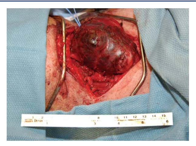
Fig. 2: Intraoperative photograph: Left thyroid mass after ligating all vascular pedicles. Note the firm, gray-tan areas at the superior and inferior poles (photo left—superior, right—inferior)