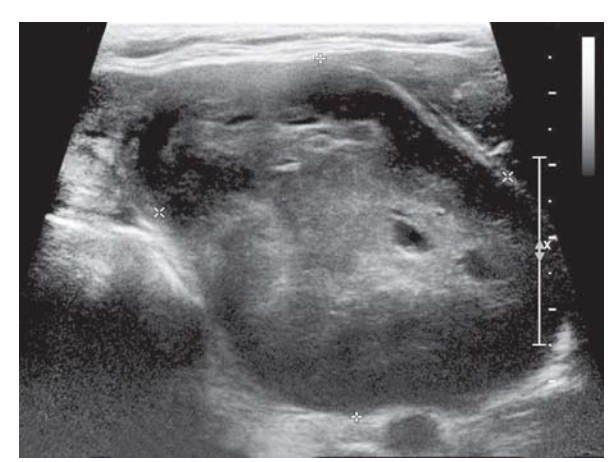
Fig. 1: Neck ultrasonography revealing a 4.5 \times 6.2 heterogenous mass emanating from the left thyroid gland

Pathologic examination revealed spindle cells in a fascicular arrangement with hyperchromatic, pleomorphic, bizarre nuclei with marked atypia (Fig. 3) and areas of hemorrhage and necrosis. Immunohistochemical stains were positive for vimentin and CD-68. Direct comparison of the