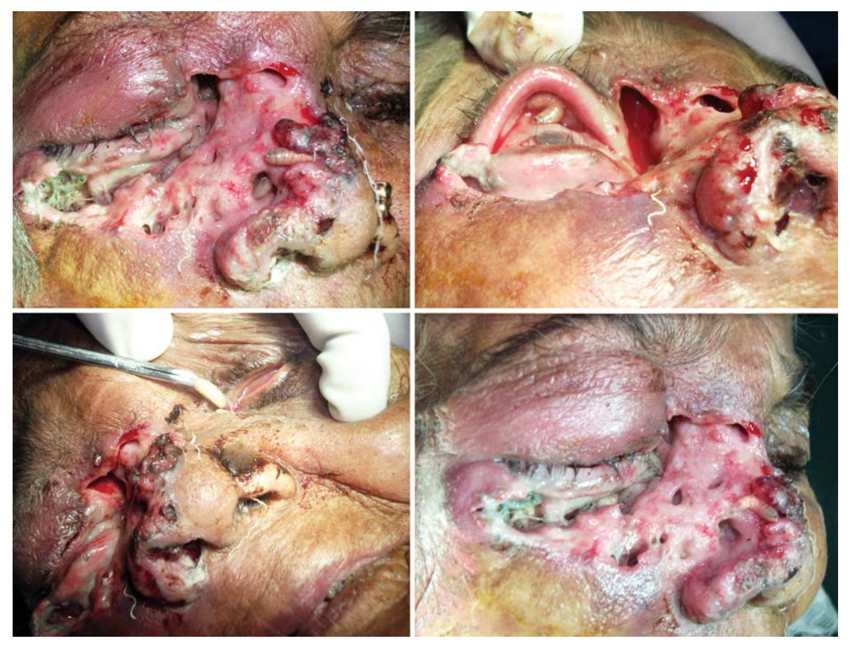
Fig. 2: Reduced maggots number on day 3, with the open pockets seen in the other eye also