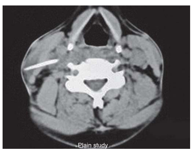
Fig. 4: CT scan showing a foreign body transversely located at the right sternocleidomastoid muscle with no evidence of abscess

bodies can become lodged in the tonsil, base of the tongue, pyriform fossa, and cervical esophagus. Only rarely do foreign bodies penetrate the wall of the aerodigestive tract,