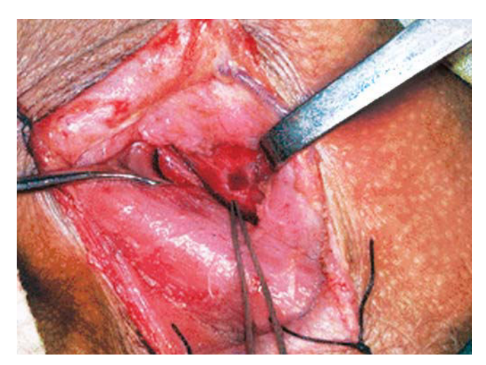
Fig. 3: Perforation at the apex of right pyriform fossa