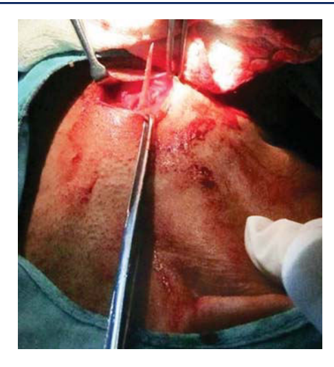
Fig. 5: Sharp linear serrated fish bone

and even more rarely do they migrate into the soft tissue and viscera of neck.<sup>2</sup> Remson et al in 1983 reported that out of 321 cases of penetrating esophageal foreign bodies, 43 of them migrated extraluminal.<sup>3</sup> Foreign bodies that are sharper and those that are more horizontally oriented have a higher chance of penetrating the wall of the aerodigestive tract. When perforation occurs, it is facilitated by the strong contraction of the hypopharyngeal and cricoesophageal muscles as they propel a food bolus into the esophagus; this explains why higher rates of penetration occur in the hypopharynx and cervical esophagus. The mechanism of migration is thought to be due to movement of neck muscle and viscera during voluntary or involuntary movements of the head and neck structures.