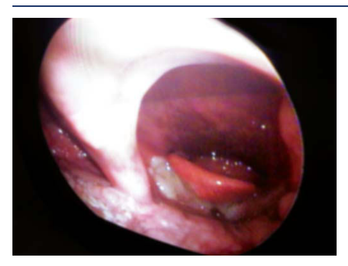
Fig. 3: 7th day Postop view of vallecula and epiglottis

identification and timely intervention is life saving in these cases.