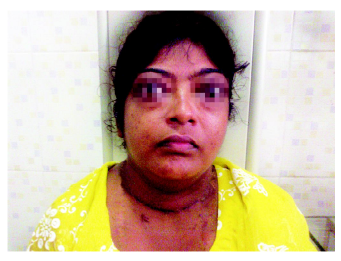
Fig. 2: Psammoma bodies in PTC

Prevalence of incidental microcarcinoma in thyroidectomy specimens of Graves disease ranges from 0.3 to 16.6% in various studies. Some studies have shown that patients of Grave's disease with thyroid cancer do better. On the contrary few others have reported contradictory findings. However, there is no established relationship between ophthalmopathy, thyroid function, and the biologic behavior of the cancer, when TAO is accompanied by thyroid cancer. It is unclear whether the thyroid cancer cells would elicit autoimmunity in orbital tissues. Also there is no evidence that thyroid autoimmunity might have stimulated thyroid cancer growth. The causal association between thyroid cancer and TAO is difficult to demonstrate in small case series.