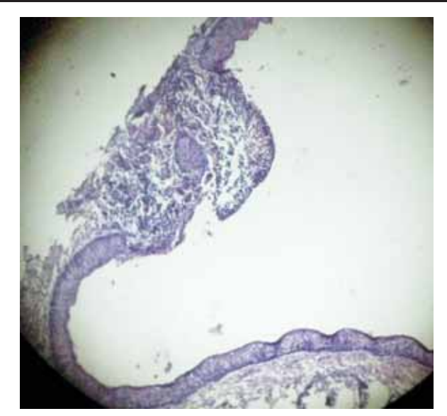
Fig. 3: Photomicrograph showing characteristic lining of keratocystic odontogenic tumor (H&E stain)