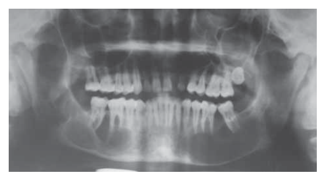
Fig. 2: Panoramic radiograph showing multilocular appearance of the lesion