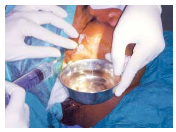
Fig. 2: The procedure being carried out under local anesthesia

treatment modality, which should be minimally invasive and at the same time, provide effective and long lasting results.