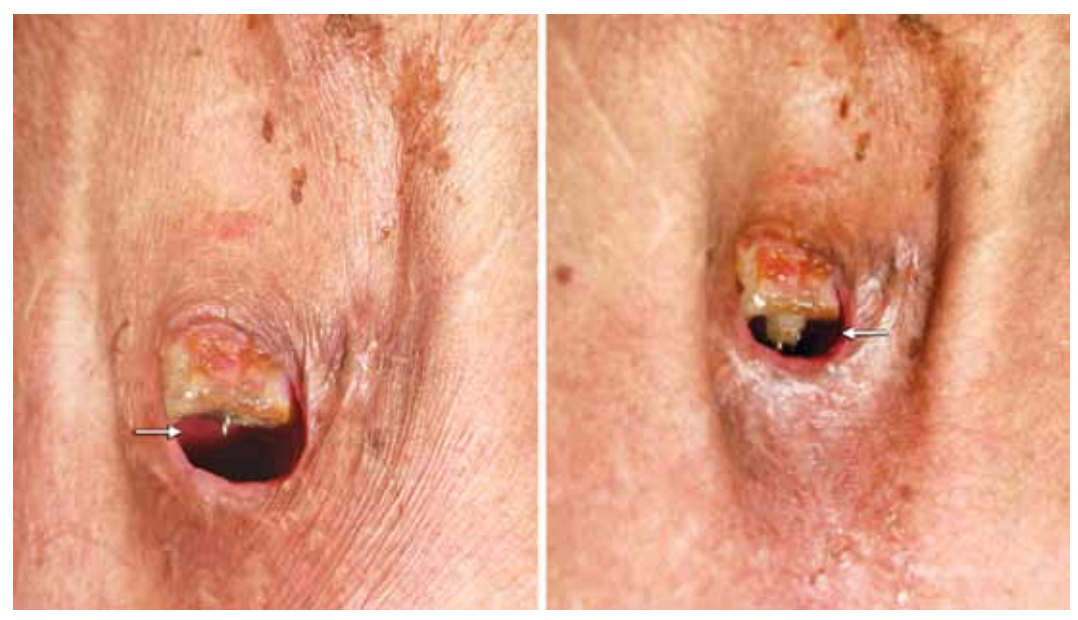
Fig. 2: Foreign body, the broken cleaning brush seen