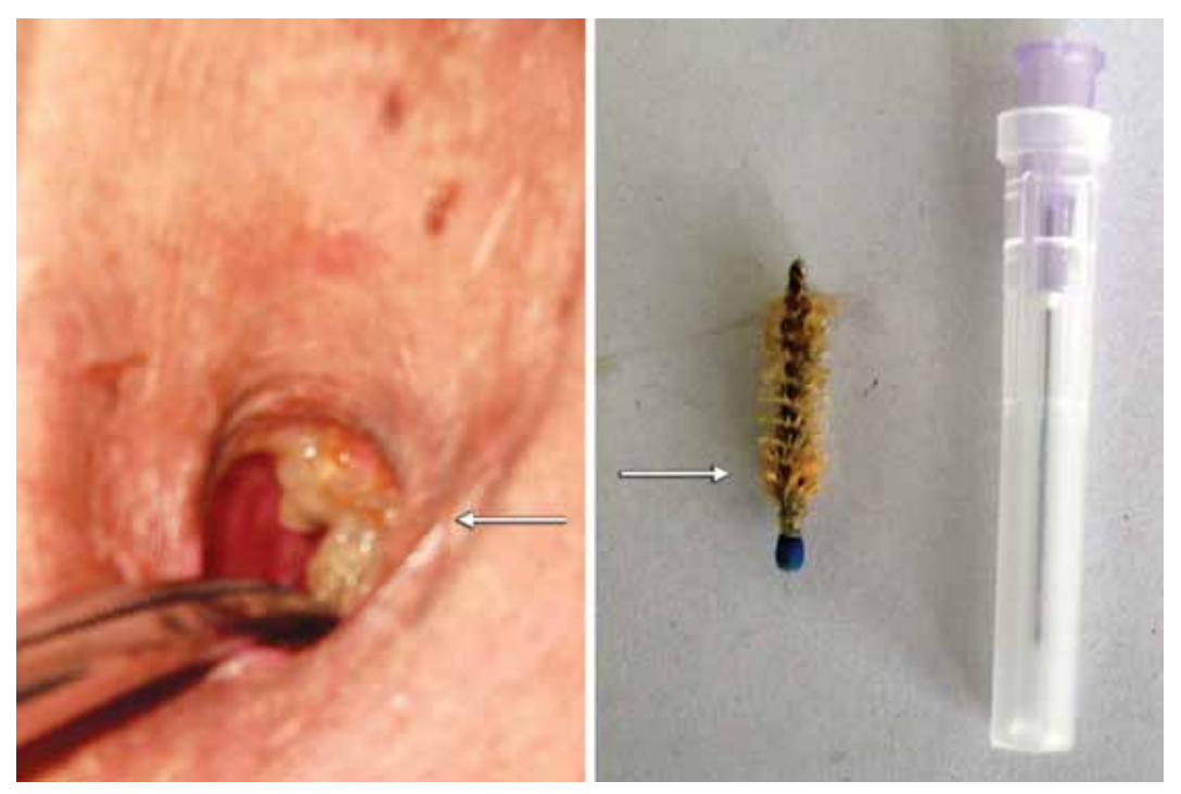
Fig. 3: Removal under topical anesthesia in the outpatients

Total laryngectomy represents a significant burden on patients function and cosmesis but the greatest concern is the profound impact on phonation.<sup>10</sup>