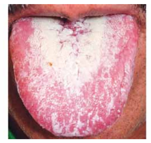
Fig. 1: Oral tongue burns 3 days after consumption

Clinical features depend on the quantity of ingestion and usually present with vomiting, respiratory distress, hematemesis and hematuria.<sup>7</sup> Hematochezia and blood vomitus may be seen with 30 to 4 ml FA ingestion associated with acute abdomen and dark red urine.<sup>7,8</sup> Common complaints were oral cavity burns, metabolic acidosis, septicemia, dysphagia, esophageal stricture, gastrointestinal perforation, aspiration pneumonia, ARDS, acute renal failure, chemical pneumonitis and shock.<sup>7,8</sup>