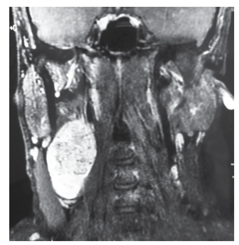
Fig. 3: Magnetic resonance imaging of neck showing a heterogeneously enhancing lesion of 8.1 × 5.2 cm in the right parapharyngeal space

A 22-year-old gentleman presented with an asymptomatic swelling in the right upper neck of 4 years duration. Clinical examination revealed a firm 6 × 3.5 cm swelling