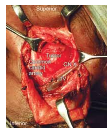
Fig. 5: Intraoperative photograph showing the tumor arising from the left cervical sympathetic chain displacing the IJV, carotid artery and vagus nerve anteriorly