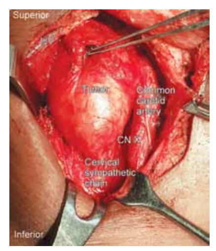
Fig. 6: Intraoperative photograph showing the tumor arising from the right cervical sympathetic chain

Fig. 5: Intraoperative photograph showing the tumor arising from the left cervical sympathetic chain displacing the IJV, carotid artery and vagus nerve anteriorly