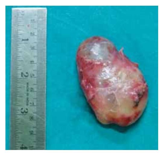
Fig. 2: A pear-shaped 7 × 4 cm encapsulated tumor is excised

Fig. 1: Intraoperative photograph after tumor excision showing the carotid bifurcation, vagus nerve and hypoglossal nerve