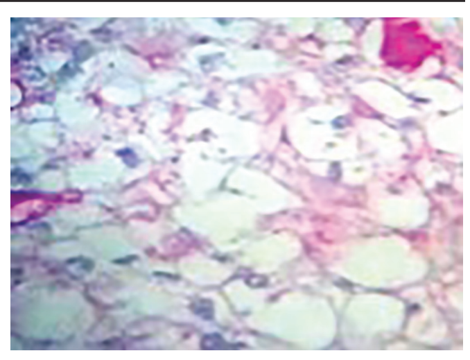
Fig. 3: Clear cells showing PAS-positive granules (PAS stain 40× magnification)

was made. Surgery was performed under general anesthesia, which included wide excision with right hemimandibulectomy, selective neck dissection (levels I–IV clearance) along with removal of sternocleidomastoid muscle. The defect was reconstructed with pectoralis major myocutaneous flap.